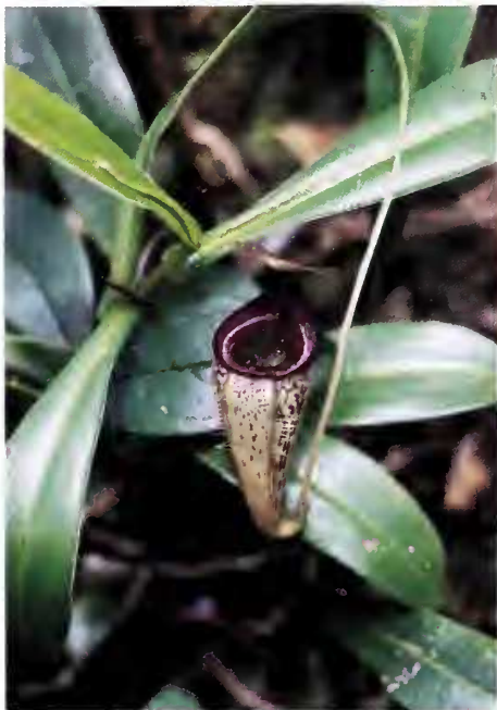
N. bongso From G. Talang